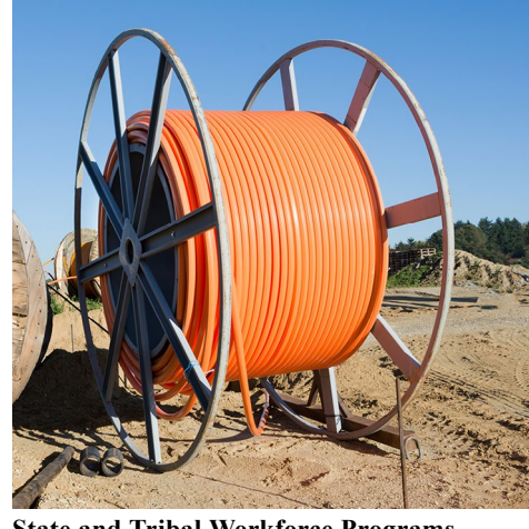
State and Tribal Workforce Programs Outside the BEAD program, states and tribal nations have used their own appropriations or other federal funding sources to create or expand existing workforce development programs to

was enacted as part of the 2021 Infrastructure Investment and Jobs Act, and issued a restructuring policy notice. Among other changes, the policy notice rescinded funds previously allocated for nondeployment activities, or programs that are complementary to broadband network construction—including funds earmarked for broadband workforce development. Many states had already begun using these funds to train prospective workers; after the policy notice was released, they canceled programming as they awaited further guidance. Availability of these funds is uncertain as the National Telecommunications and Information Administration (NTIA) continues a delayed review of which activities will be eligible for support. Regardless of the outcome of that review, workforce shortages require state policymakers, higher education partners, and ISPs to coordinate closely to fill gaps and meet BEAD milestones. Following are prominent examples of the varied approaches that are currently in use and that show the importance of cross-sector collaboration as states prepare for BEAD implementation.